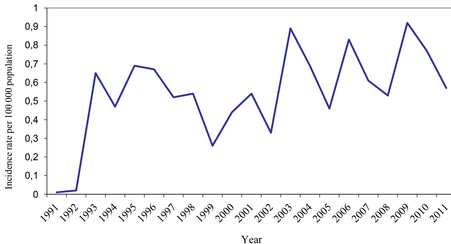
Fig. 1. Tick-borne encephalitis, Poland, 1991-2011. Incidence per 100,000 population

occurred in all provinces, with the highest incidence recorded in the Warminsko-Mazurskie (0.83 per 100 thousand.), the lowest in Świętokrzyskie - 0.08/100 thousand. (Table II.) According to the National Immunization Program in 2011, vaccination against S. pneumoniae was mandatory only for children within high-risk groups with specific medical indications. However, it was recommended for people over 65 years of age, children over 2 years of age and adults at risk. In 2011, in Poland 176 648 people were vaccinated against S. pneumoniae as compared to 2010 (155 258 vaccinated) it was an increase of 13.8%. Predominated among those vaccinated were children under 14 years of age - 159 199 (90.1%).